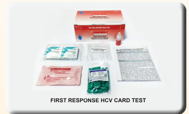
FIRST RESPONSE HCV CARD TEST

For the detection of antibodies to Hepatitis C virus in human serum / plasma / whole blood