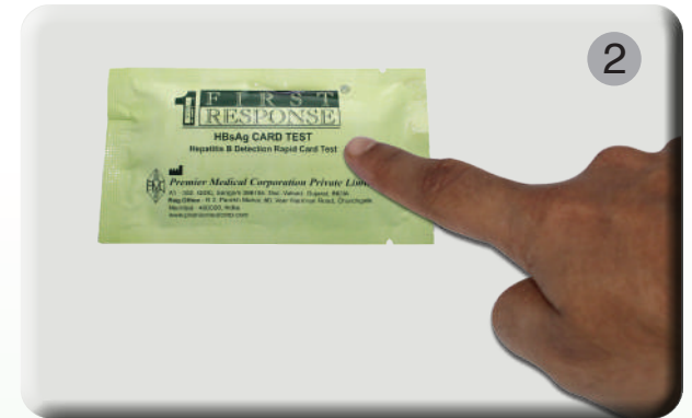
2 Confirm product name and check the sealing of test device pouch.