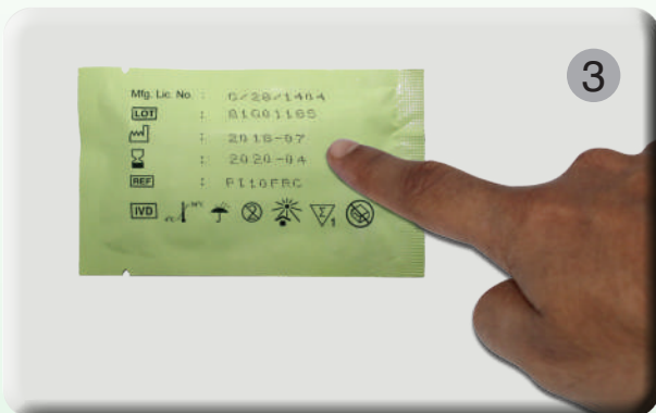
3 Check expiry date on the test pouch. (If expired, do not use)