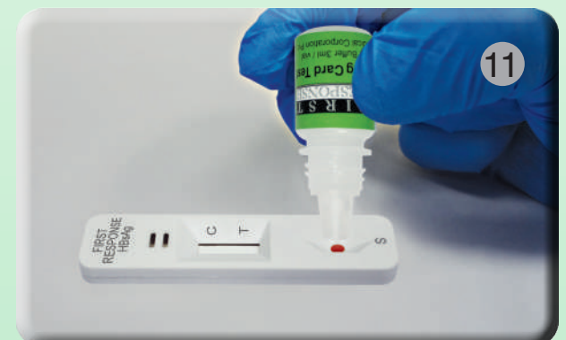
11 Add one drop of assay buffer into the specimen well.