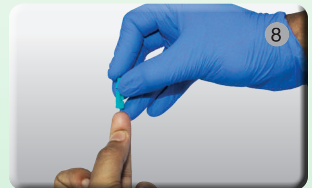
8 Push lancet gently against test site. Wipe the first drop of blood and discard the lancet into sharp bin.