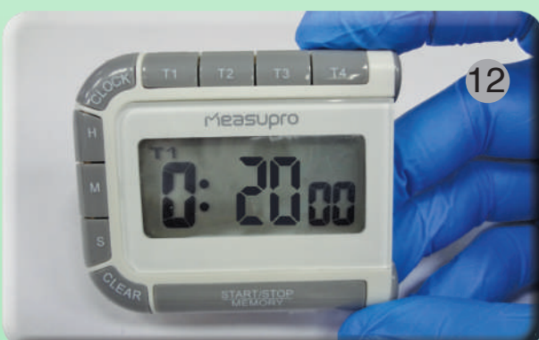
12 Read test results at 20 Minutes. Don't interpret after 20 Minutes.