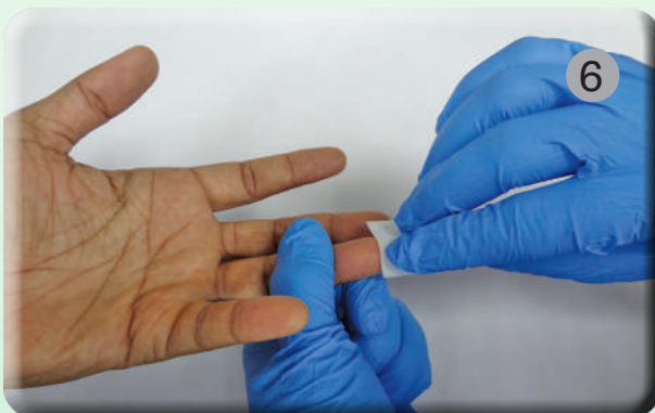
6 Wipe the client's finger with the alcohol swab. (Alcohol must be dry before pricking)