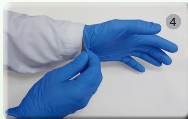
4 Put on gloves. (Use new gloves for each client)