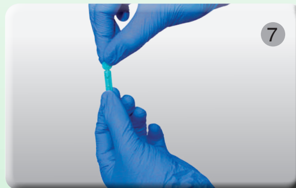
7 Remove clear protective cap of the lancet