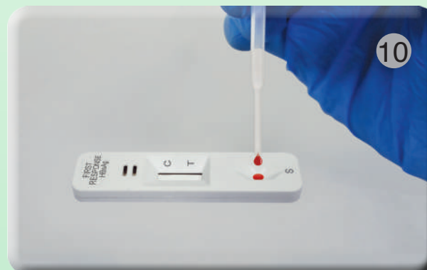
10 Add two drops of Whole blood/serum /plasma into the specimen well.