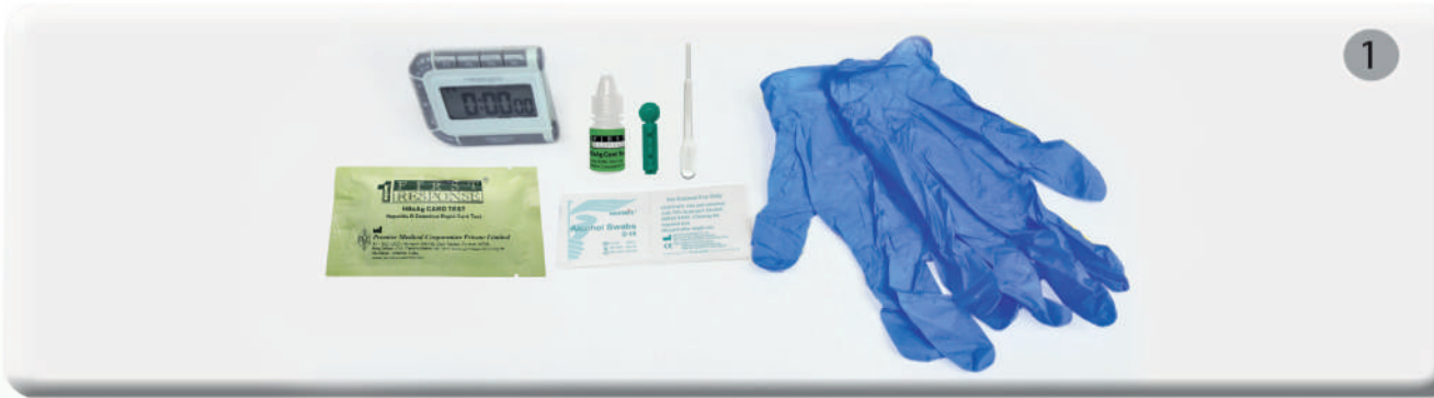
1 Prepare all items shown above for testing. (Timer and gloves are not provided in the test kit; they must be available)