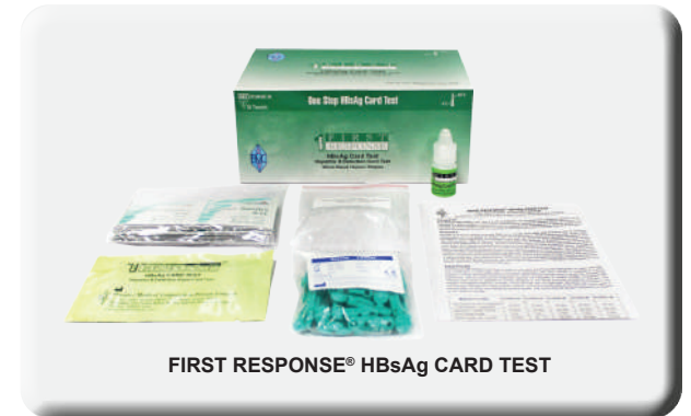
FIRST RESPONSE ® HBsAg CARD TEST

For the detection of Hepatitis B surface antigen in human whole blood / serum / plasma